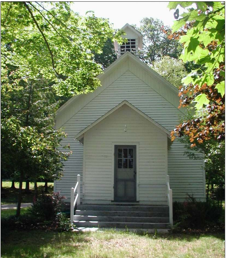
Old Settlers Chapel, Old Settlers Park, Burdickville

Website: https://housedems.com/betsy-coffia/