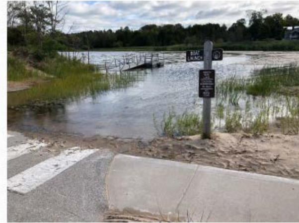
Sep 7, 2020