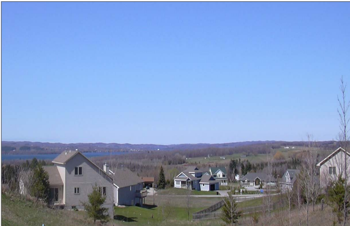
Timberlee area in Elmwood Township

The preface includes a description of the history of the efforts which led to the creation of the first General Plan in 1994. A key opinion of many citizens and local officials in the county was that the usual historical approaches to planning in the County had not achieved a desirable result.