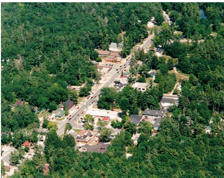
Birdseye view of Glen Arbor Village

If the mutual goals of this General Plan are to be achieved, it will take the coordinated efforts of all units of government working together to achieve them. Strong intergovernmental cooperation founded on mutual respect and mutual support in achievement of the common goals of this General Plan is fundamental to a better future for Leelanau County.