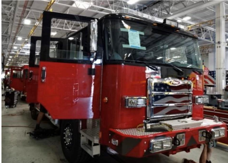
Engine 811 photo at the Pierce plant in Bradenton, FL

Fire Office 8907 Railroad Ave. ~ Cedar, MI 49621 Phone: (231) 228-5396 Cell: (231) 735-3930