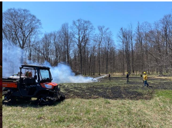
Grass Fire on S. Sullivan Road 05/06/2020