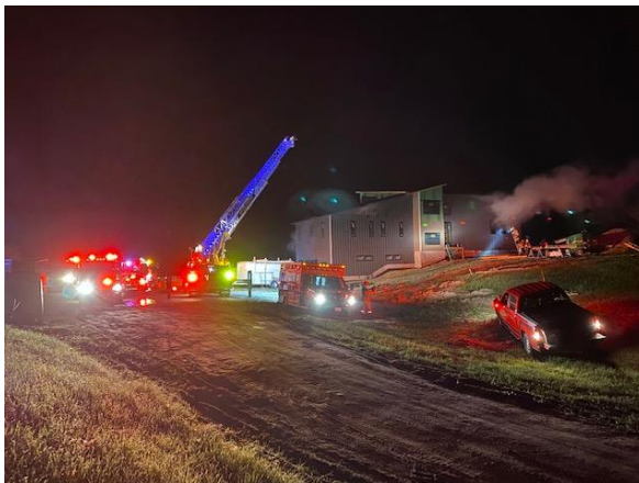
Structure Fire on S. Maple City Road 05/15/2020