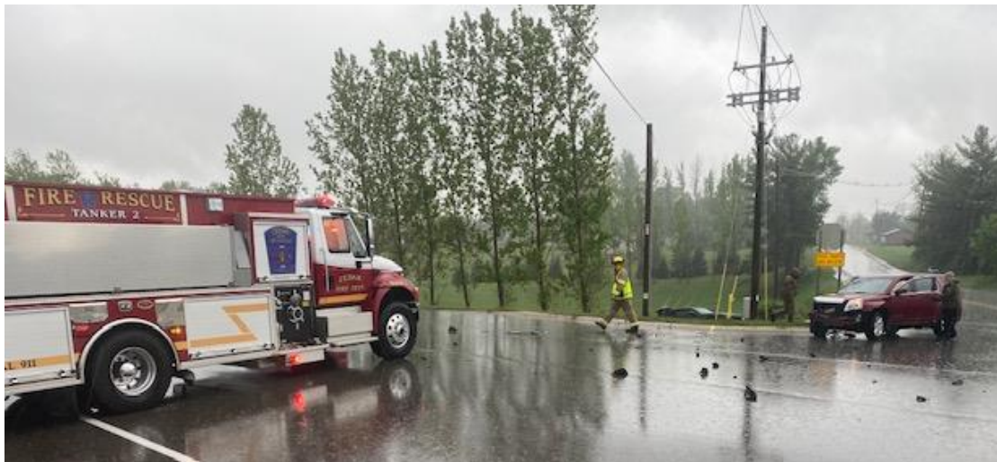
05/31/2020- Vehicle accident with injuries at M-72 and Cedar Road

I. CAFR responded to 34 EMS calls throughout May. One of the calls was a vehicle accident with injuries, all other calls were typical in nature