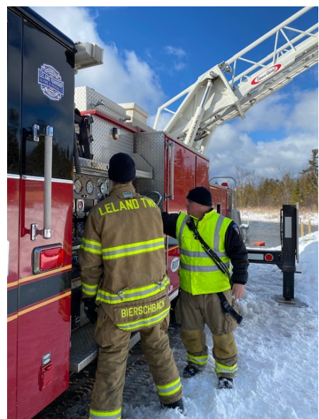
Helping To Protect The Peninsula