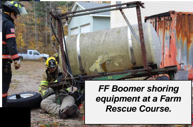
FF Boomer shoring equipment at a Farm Rescue Course.