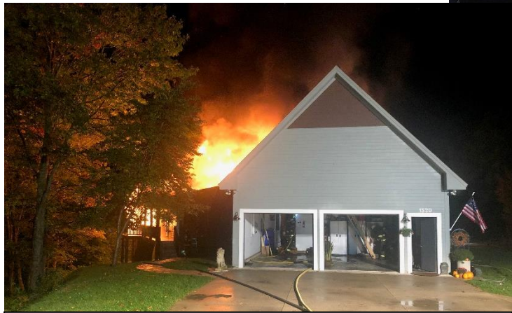
House fire in Leland