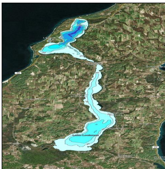
Figure 1. A depth contour map of Lake Leelanau.