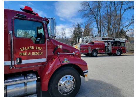
Training! Picture here are Tanker 521 and Ladder 531 at the DNR Boat Launch next to the Bluebird Restaurant. They were working on a "hitch relay" water supply scenario to perfect their craft.