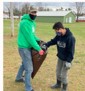
Work Bee at the Fairgrounds