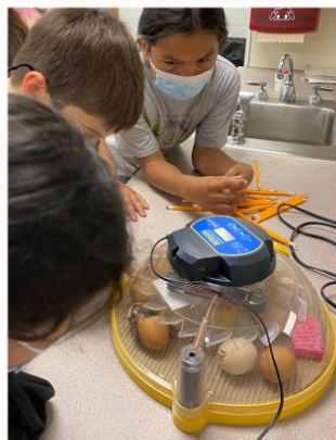
4-H Embryology Program at Suttons Bay Elementary