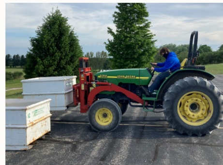
Tractor Safety Program