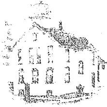
Grand Traverse Lighthouse