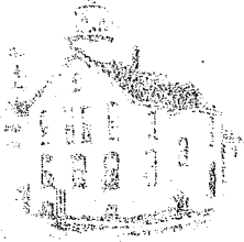
Grand Traverse Lighthouse