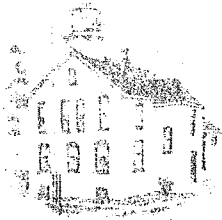
Grand Traverse Lighthouse