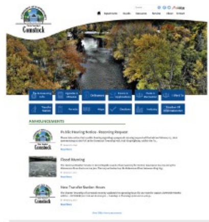
Comstock Charter Township www.comstockmi.gov