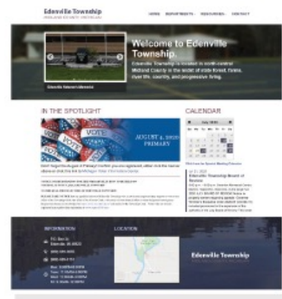
Edenville Township www.edenvilletwp.org