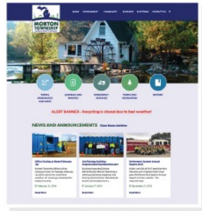
Morton Township www.mortontownship.org