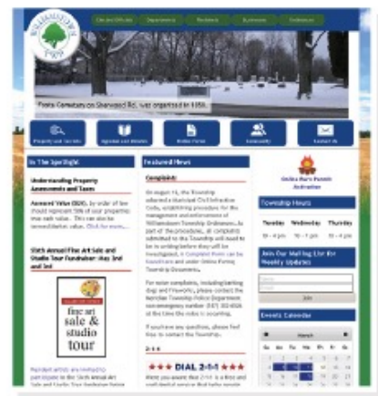
Williamstown Township www.williamstowntownship.com