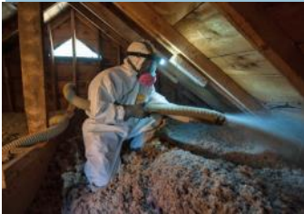
A worker adding blown cellulose to an attic.